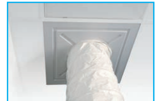
Condenser Discharge Kit