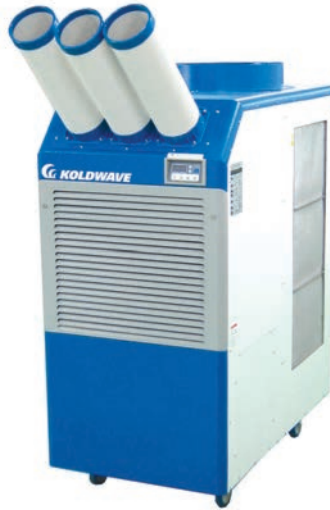
6KK61 6KK71 6KK92