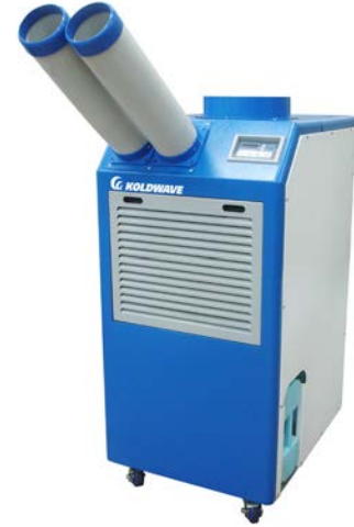
6HK16 Heat Pump