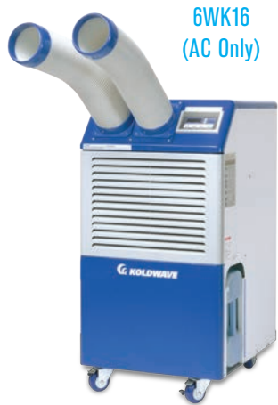
6WK16 (AC Only)