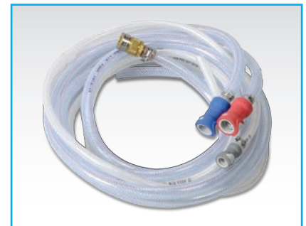
20' Hose Kit